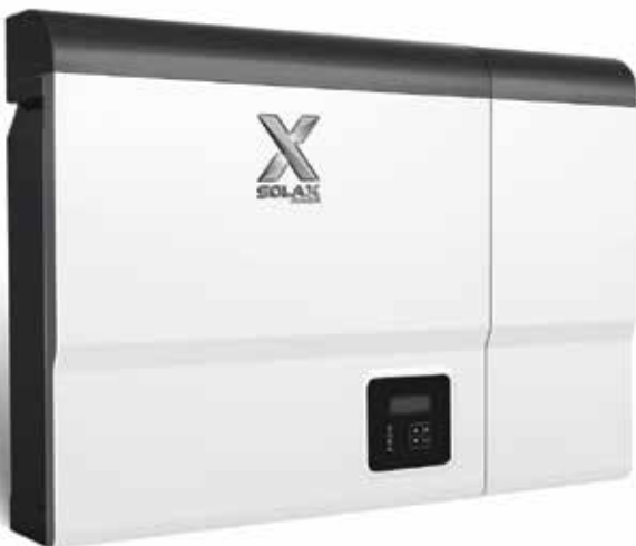
SK-SU3000 / SK-SU3700 / SK-SU5000 WITH CHARGER

When looking for a quality stand alone inverter that boasts performance that allows you to gain the most from your feed-in-tariff, the Sunbank TL- 3000 Series is a guaranteed investment.