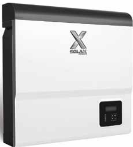
SK-TL3000 / SK-TL3700 / SK-TL5000